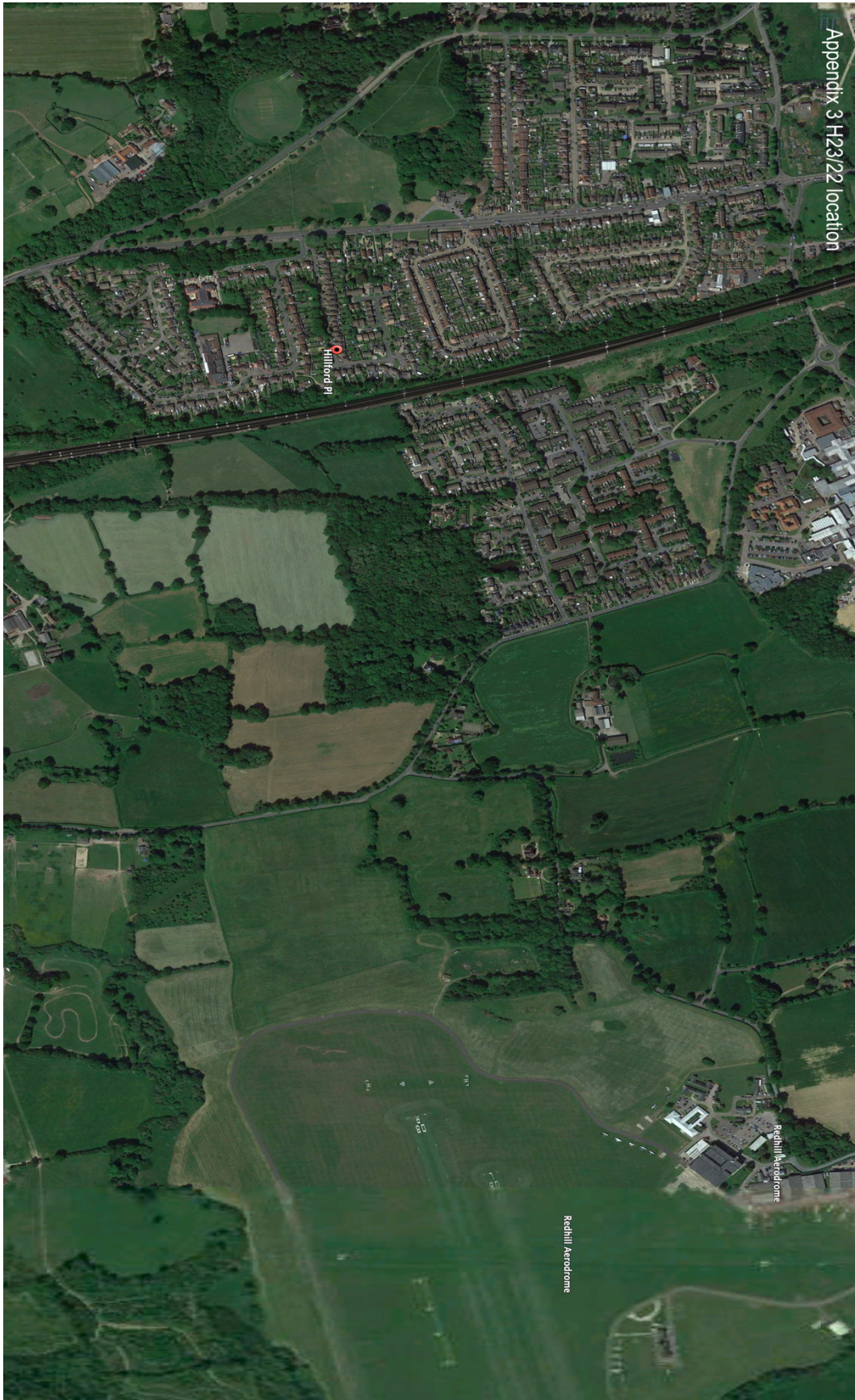
Appendix 3 H23/22 location