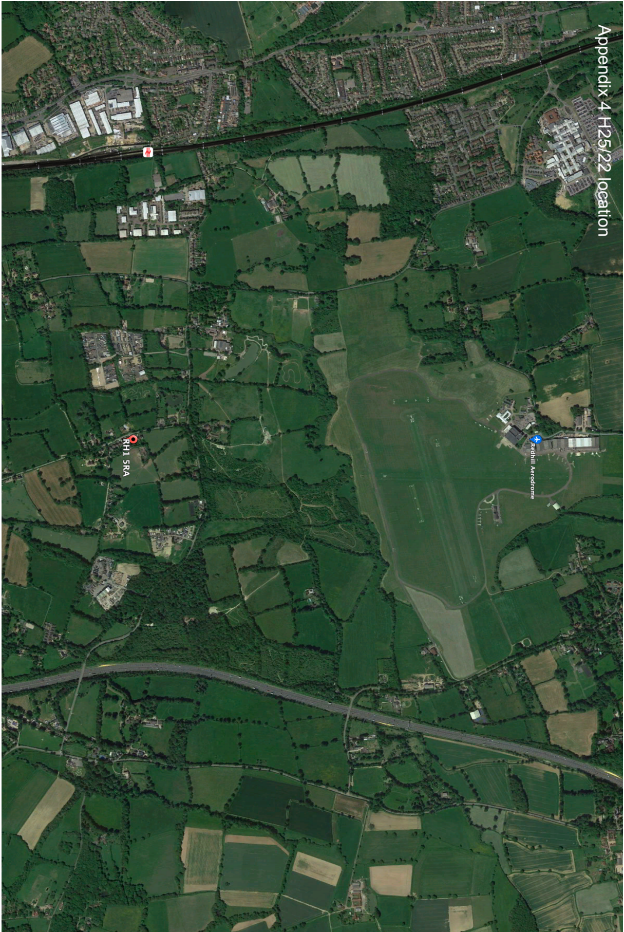
Appendix 4 H25/22 location