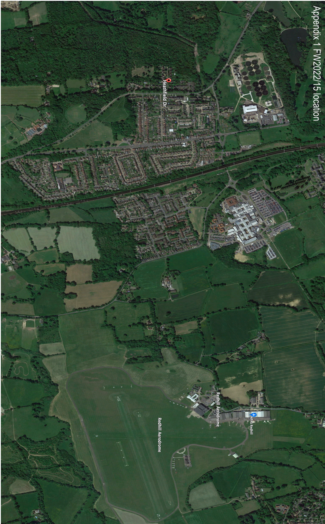
Appendix 1 FW2022/15 location